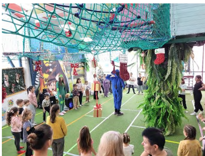
Figure 4 Pictures from the Christmas Party

BSOG ended the project again with a Christmas party organized in Constanta for preschool and primary school children from Vadu. As in previous years, the children had time to explore the playground, they had entertainers and ended the party with pizza, cake and presents.