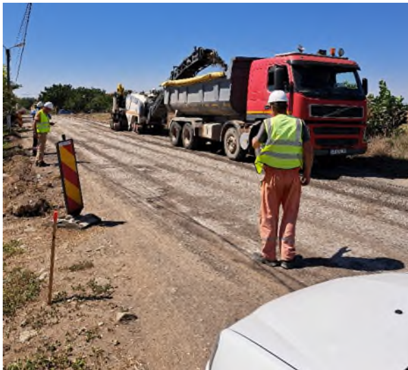
Figure 5 Pictures from Corbu Vadu Road Rehabilitation

At the end of 2024 the project was 64% finalized.