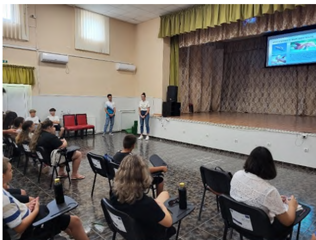
Figure 2 Pictures from #DeltaGeneration Summer School