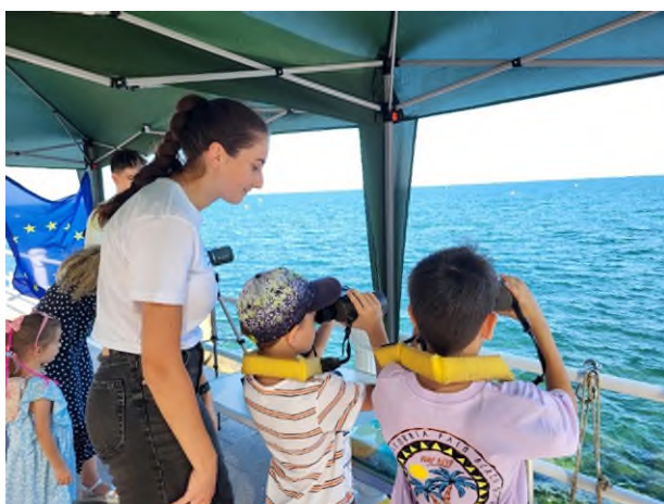
Figure 2 Pictures from Dolphin Day

As part of the information point, a stand for the Adopt a Dolphin campaign was also set up, where participants had the opportunity to find out how they can support the organization's efforts to protect dolphins.