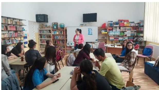
Figure 1 Pictures from the Volunteers clubs

To celebrate the involvement of the students, a festive gala was organized on 6 December at Scoica Land (Mamaia). The gala included the presentation of each club, artistic moments inspired by the project, socializing games, music and dance, a photo exhibition, as well as the awarding of the "Hero of the Delta" diplomas and medals.